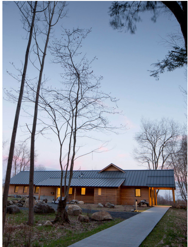
Living Certified Bechtel Environmental Center Whately, MA

The following incentives have been utilized in communities around the country in order to encourage the development of green buildings. You may find that some of them are in place in your community at this very moment. Historically, these incentives have been used for various green building programs and for individual green building strategies, such as energy or water efficiency improvements. If your community is already offering one of these incentives for developers, discuss adapting it to encourage the Living Building and Community Challenges as well. In order to encourage LBC and LCC projects, the strength of the incentives should match the additional level of performance.