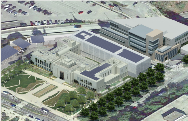
Santa Monica's City Services Building Pursuing Living Building Certification

The implementation of municipal commitments in Santa Monica, CA and King County, WA serve as testaments to the power of simplicity and individual empowerment. Each ordinance has resulted in registration and design of municipal Living Building Challenge projects, which will soon be catalyst examples in the community. Municipalities can truly lead the way to a Living Future.