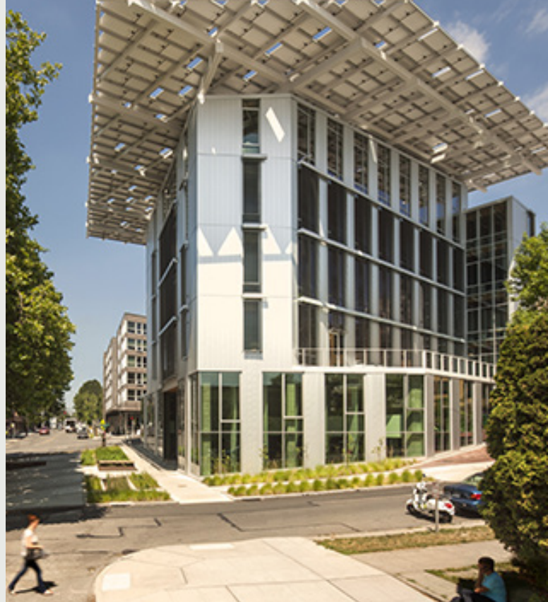
Living Certified Bullitt Center Seattle, WA

The Bullitt Center was the first project to participate in Seattle's LBPP; building height departure was used, and the extra 10 feet of height was divided among each of the floors to increase structure height for better daylight penetration. As of Spring 2018, four projects being permitted (of varying size, both residential and commercial office) are participating in the LBPP. The City of Seattle is considering additional updates to the LBPP as the program continues to be refined.