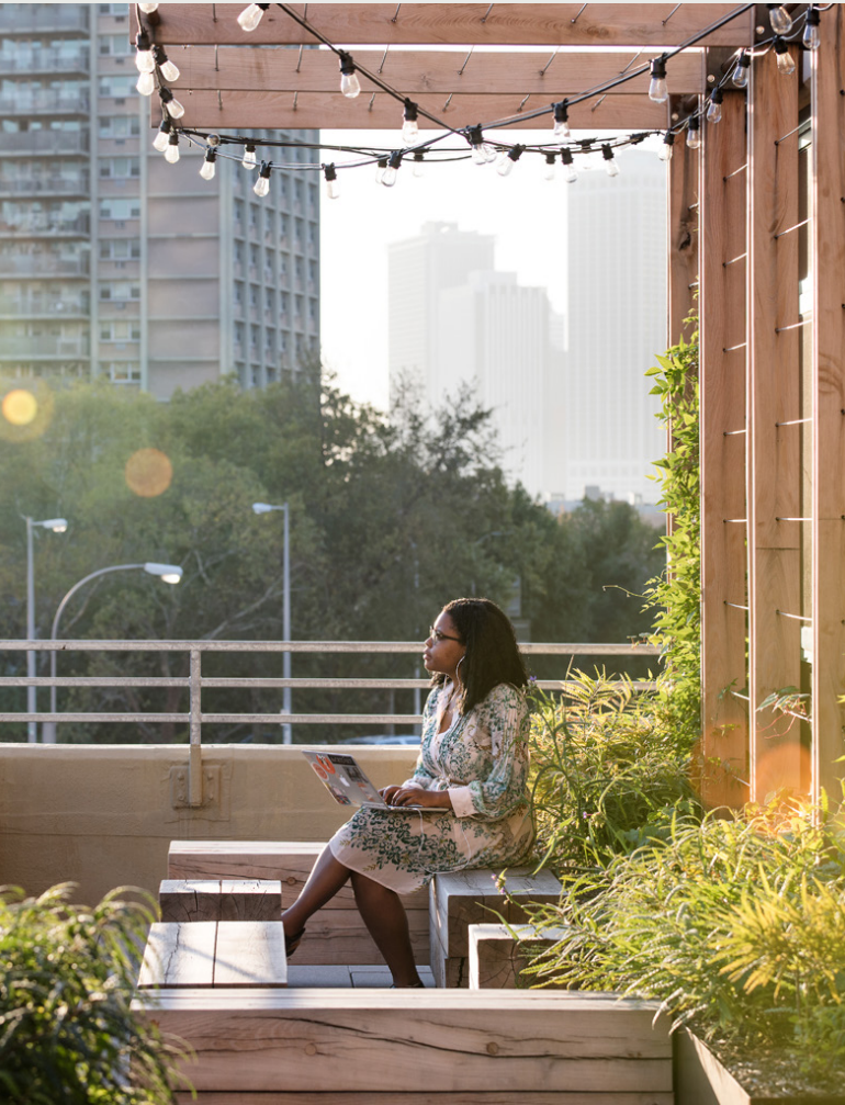
Etsy HQ, Brooklyn NY v3.0 Materials Petal Certified

Imagine a world in which Living Buildings and Communities were not just permitted by policymakers and regulators, but encouraged.