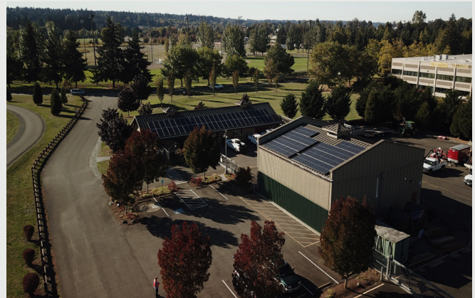
King County Parks Zero Energy Certified North Utility Maintenance Facility

The 2017 ordinance requires all City-owned new construction building projects that exceed 10,000 square feet gross floor area to meet the following standards: LEED v4 Gold Certification; Zero Energy Building Certification from the International Living Future Institute, and; zero potable water may be used for non-potable end uses in the building or in any newly installed adjacent landscaping.